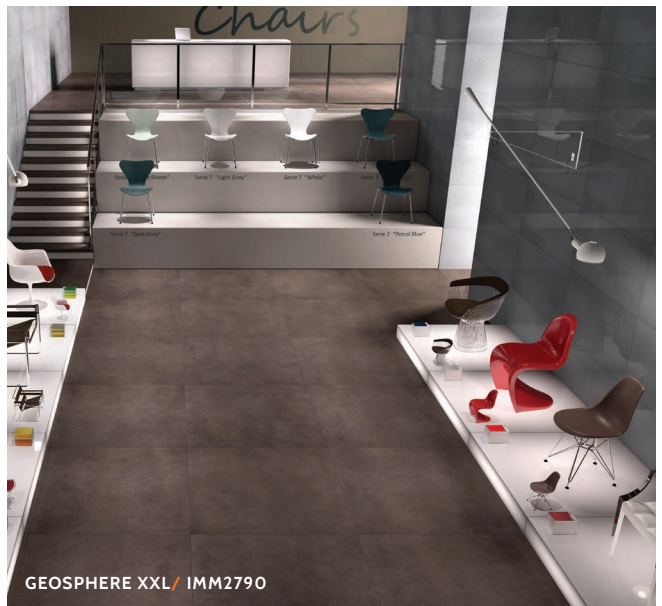
GEOSPHERE XXL / IMM2790