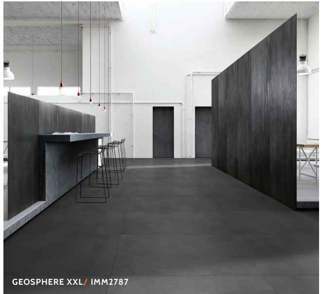
GEOSPHERE XXL / IMM2787