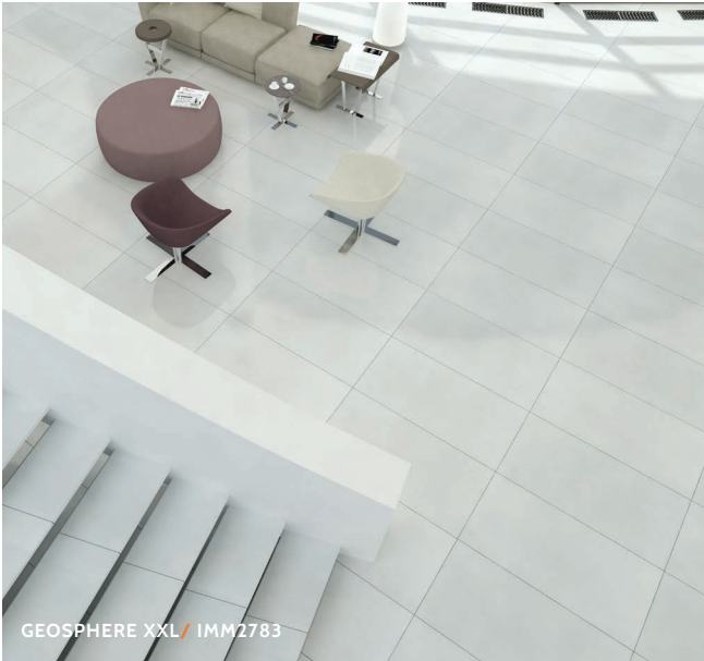
GEOSPHERE XXL / IMM2783