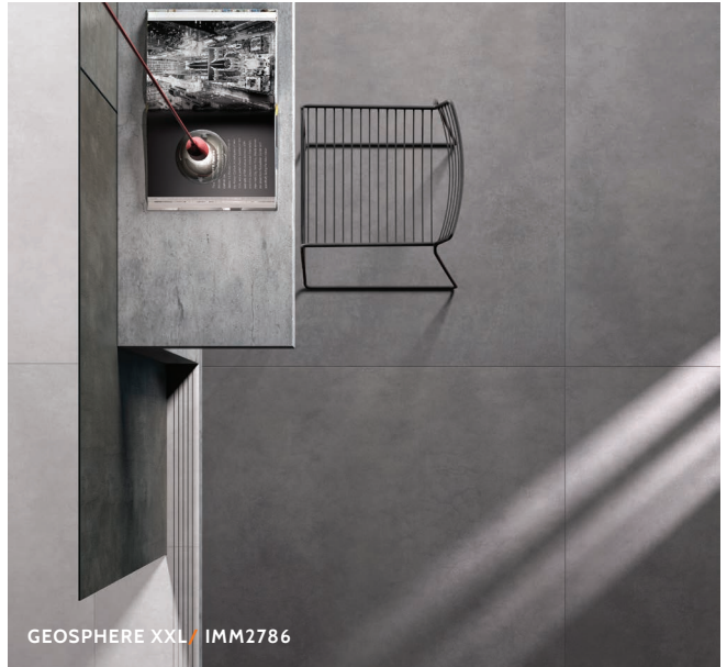
GEOSPHERE XXL / IMM2786