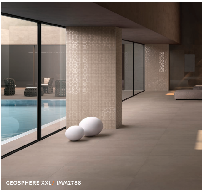
GEOSPHERE XXL / IMM2788