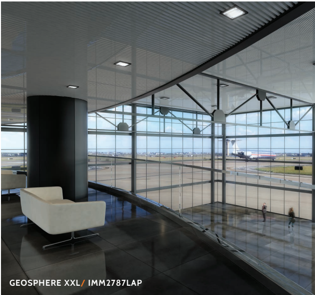
GEOSPHERE XXL / IMM2787LAP